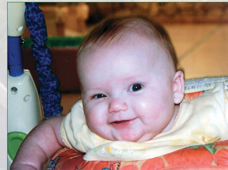
"If you think I'm cute, you should come see the rest!"