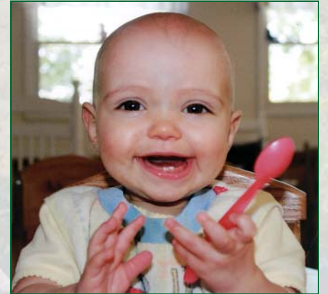
Oh Goody! Time to eat!"

P.S. Don't forget our Annual Quilt Auction next month!