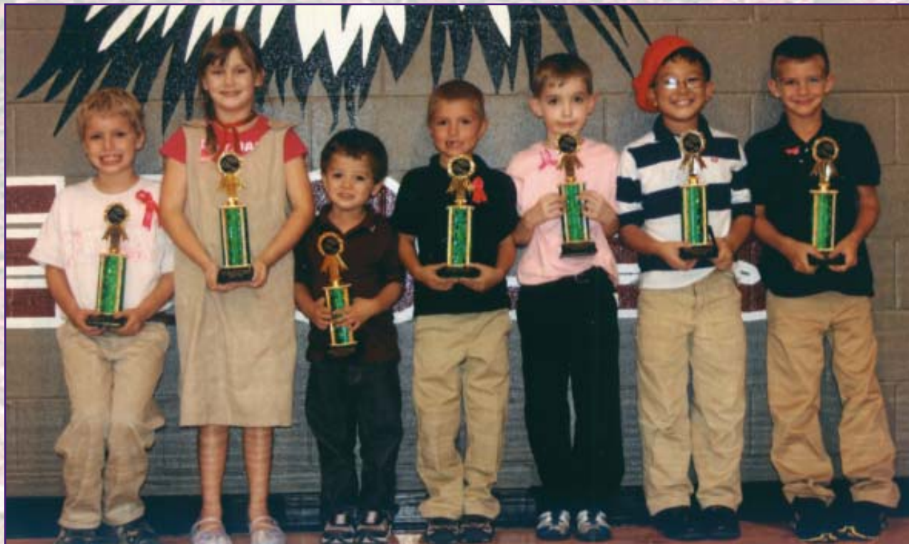
The winners of our Frog Racing Contest at the Galilean Academy