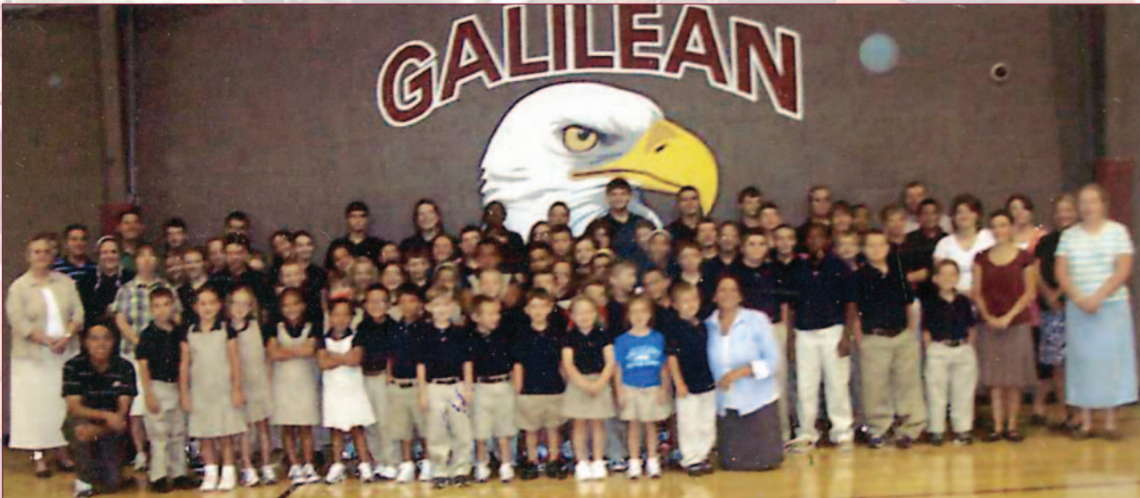
Galilean Christian Academy 2010/2011