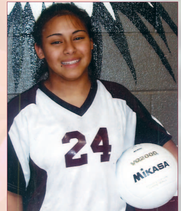
Off to Bible College