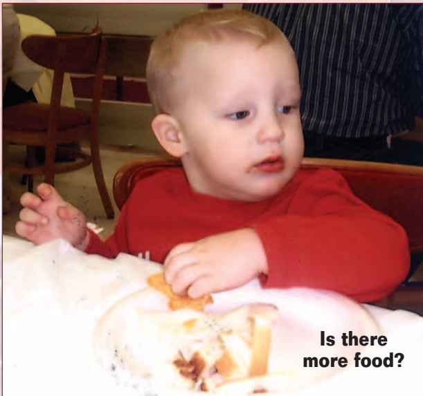
Is there more food?